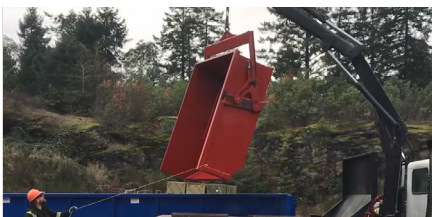
Self Dumping Crane Skip

Our new Self Dumping Crane Skip means being able to move material around a site or from a machine efficiently.