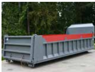
Dump Style Tailgate

To ensure the safety of your driver and truck, SCS offers an optional heavy duty cab guard for Rock Box Containers.