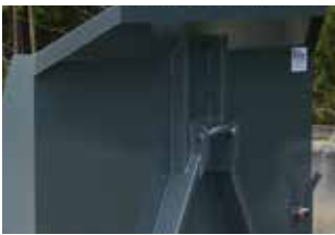
Rock Box Cab Guard

*Additional Options include Dual Purpose Systems and Narrower Widths For Nesting