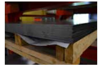
3/16" Sheet Wall Upgrade

Tailor the bin to your specific application! We offer a heavy duty D-ring tie downs installed to your specification.